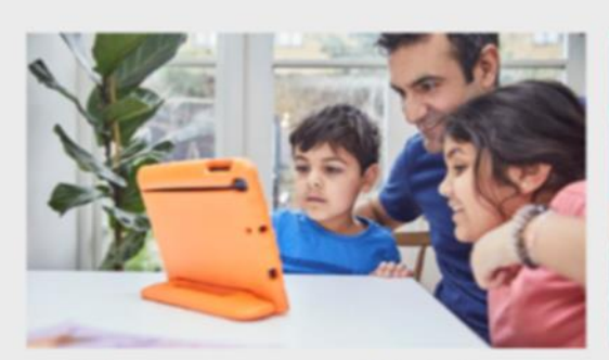
Talking to your child about online safety

Advice on how to start the conversation and get support if you're worried.