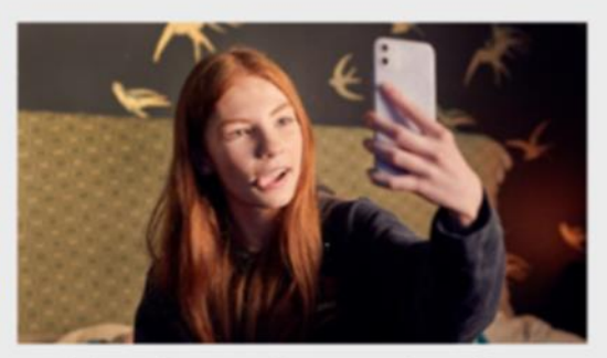
Livestreaming and online video apps

Get advice on setting up parental controls to help keep your child safe online.